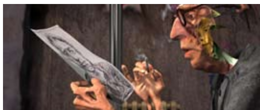
Ryan – Chris Landreth