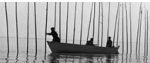
Pour la suite du monde – Michel Brault, Pierre Perrault