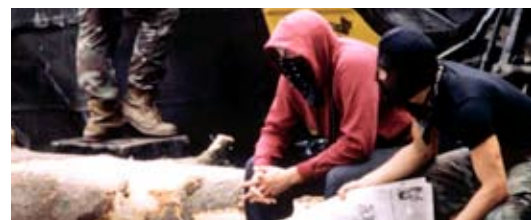
Kanehsatake: 270 Years of Resistance – Alanis Obomsawin